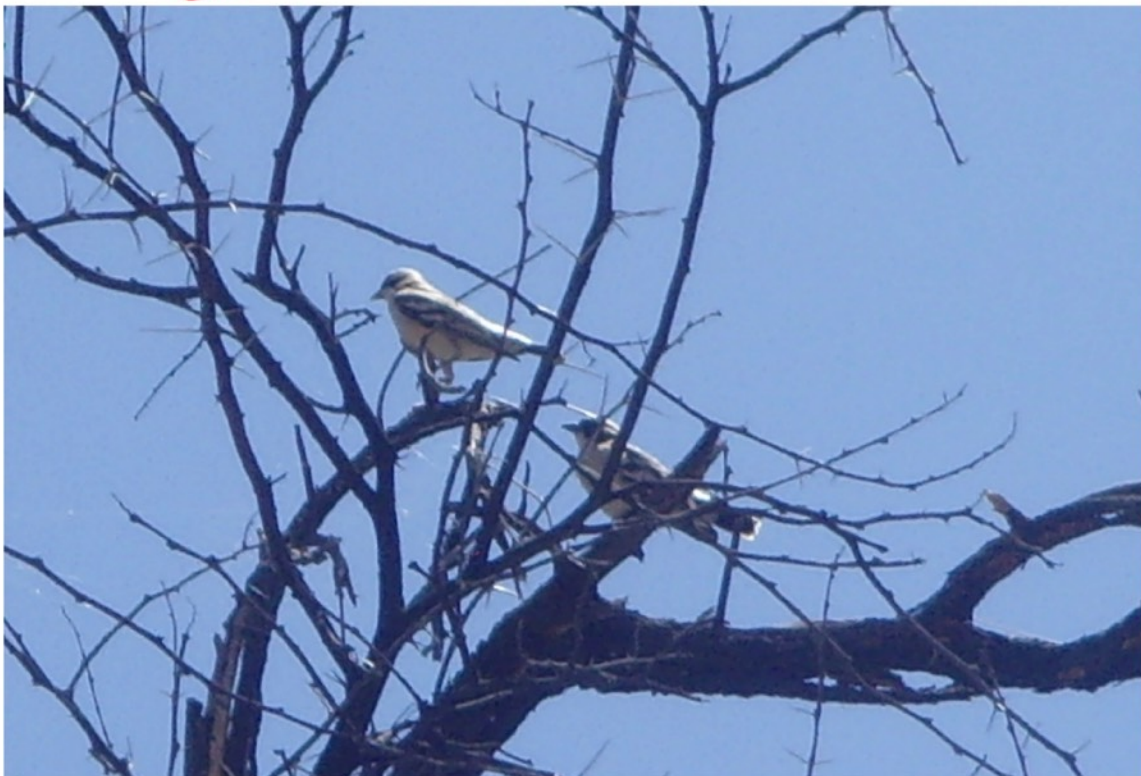
Theme for the picture above: Free Birds