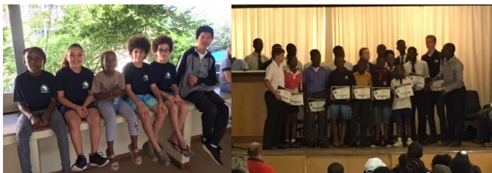
The WIS Chess Team at the Regionals hosted at St Paul's.