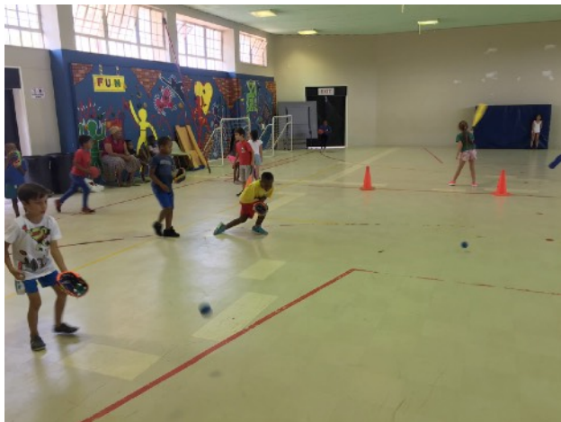
Year 2 - Striking and Fielding (UOI "Cool Tools")

In the PYP, students aim to develop an understanding of concepts and skills used in different physical activities. In class, students inquire into the "BIG IDEA" through a variety of general or specific games such as Invasion Games, Racquet Sports, Striking and Fielding Games, Athletics, etc.