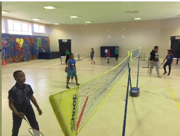
Year 3 - 4 Racquet Sports (Basic techniques and gameplay)

Through student-initiated action, practising at home or joining an afternoon activity, can help improve technique. Students can practise individually, with a sibling or parent to improve their performance. Some of the equipment used requires little space and is inexpensive to set up.