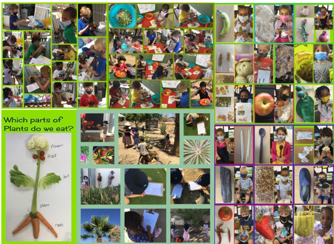
Jan le Roux (Grade 1J)

We're learning about how important plants are. We've explored plants on a campus walk, shared Show and Tell presentations about plant products, planted tomato seedlings, looked at what parts of plants we eat and even made a delicious salad.