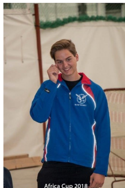
Africa Cup 2018

There has been a lot of good competition at the recent trials, what did you do in order to be selected? I have been practicing very hard and in different age groups. The open category is the most challenging. I use every opportunity to play Inline Hockey. I always give my best. I also practice in the gym in order to be strong.