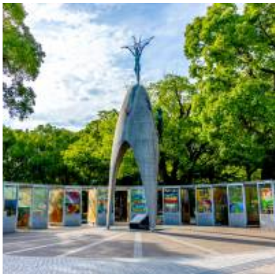
Children's Peace Memorial - Hiroshima

“It is time all nations and all people live up to the words of the Universal Declaration of Human Rights, which recognises the inherent dignity and equal and inalienable rights of all members of the human race. This year marks the 70th anniversary of that landmark document.” -- Secretary-General António Guterres ( http://www.un.org/en/events/peaceday/ )