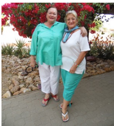
Opposite Twins - The Golden Oldies Tweedeldee and Tweedeldum From: Alice in Wonderland

I am excited to watch both the flora and fauna blossom as well as my students!