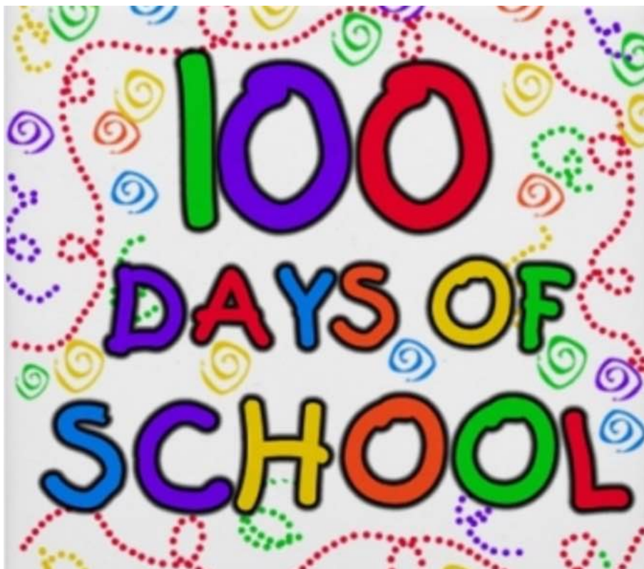
Thursday, 4th February was the 100th School Day

More information will be shared with the WIS community closer to time.