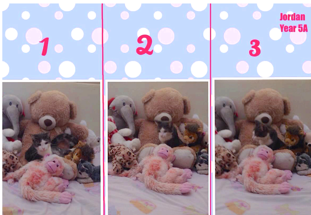
Theme for the picture above: Furry Friends