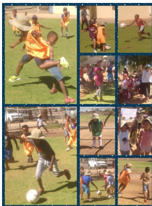
The nail biting match between 2A and 2B! Final score: 2A 1 2B 1